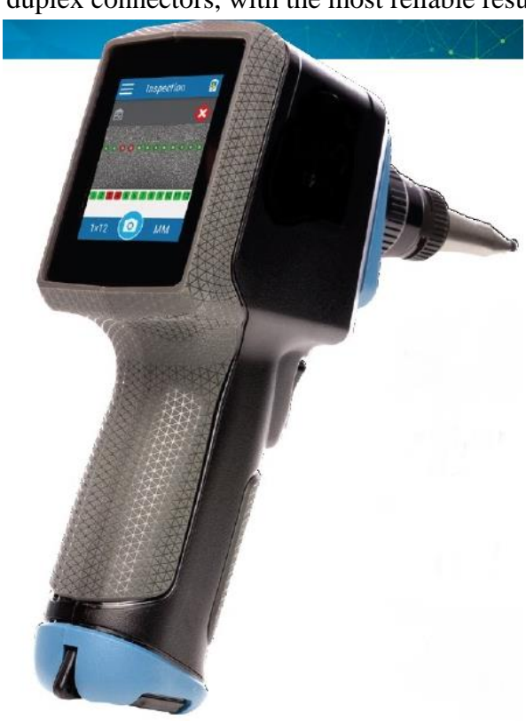
Figure 1: Fiber Inspection Scope

The Fiber Inspection Scope shall be a robust, self-contained, fully automated tool for zero-button testing all day without the need to recharge batteries or offload results. It shall be capable of providing Fast test inspection for single-fiber, multi-fiber and duplex connectors, with the most reliable results.