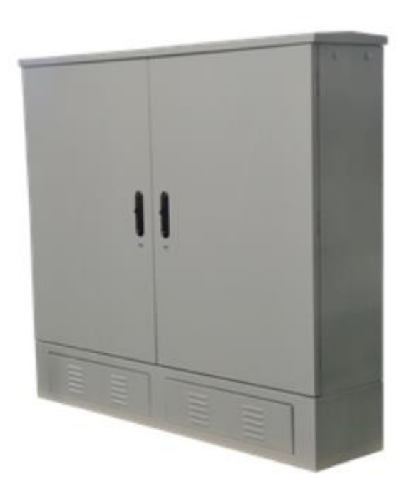
Figure 2 Fiber Distribution Terminal (FDT)