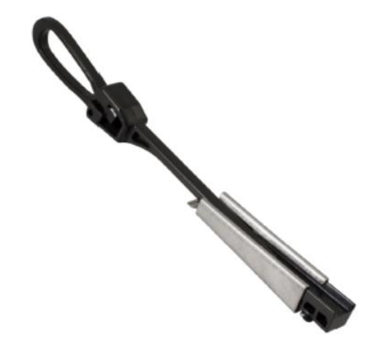
Figure 4: Hypoclamp