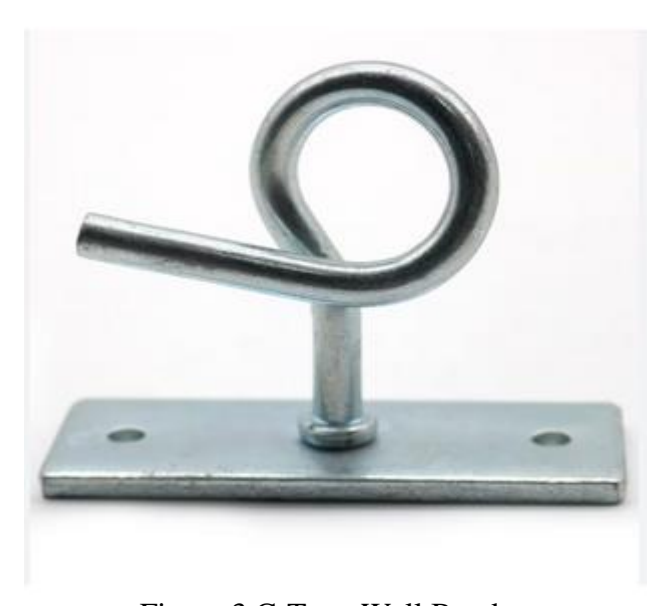
Figure 3 C-Type Wall Bracket