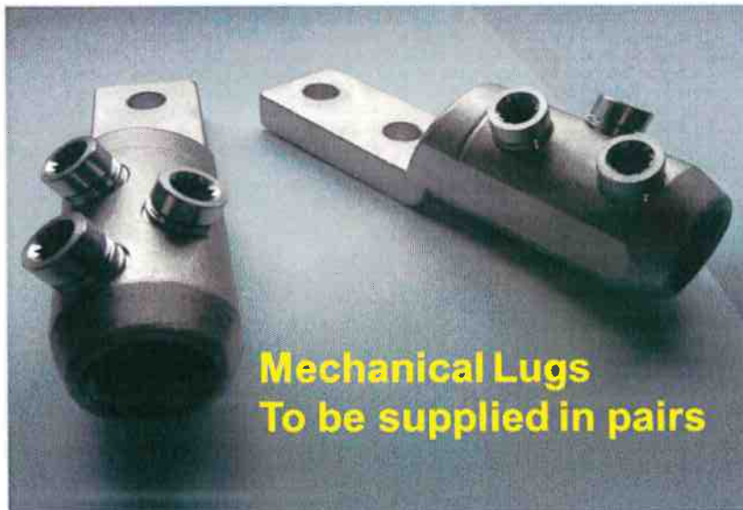
Fig 1(ii): Mechanical Lugs

The dimensions of the mechanical lugs shall be as detailed below